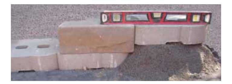
4. Install wall courses per your project's plan.

At this point, step up the height of one block and begin a new section of base trench. Use a 6-inch-high unit on the base course to level the base unit that is stepped up. (See illustration.) Continue to step up as needed to top of slope. Always bury at least one full base block at each step-up.