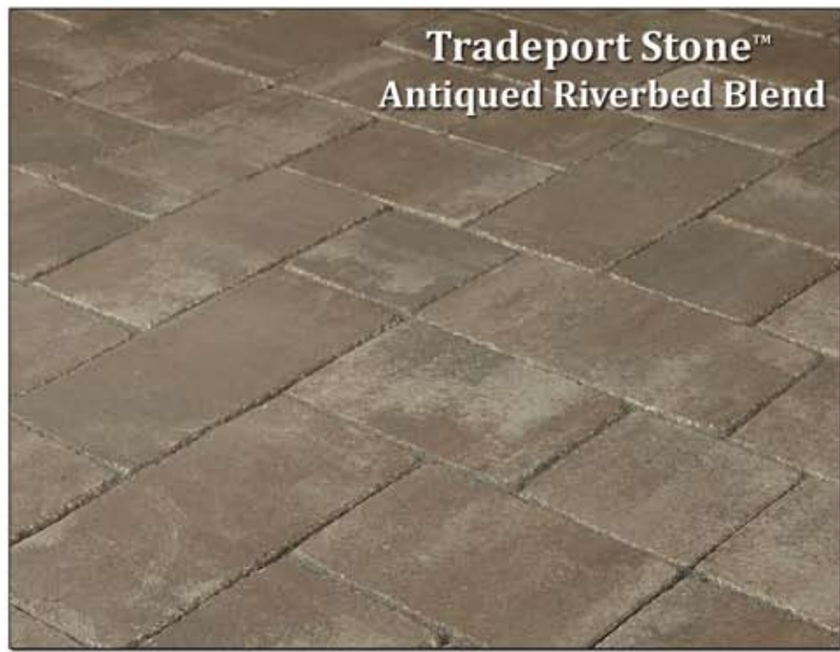
Tradeport Stone™ Antiqued Riverbed Blend

60mm thickness or in 80mm by special order.